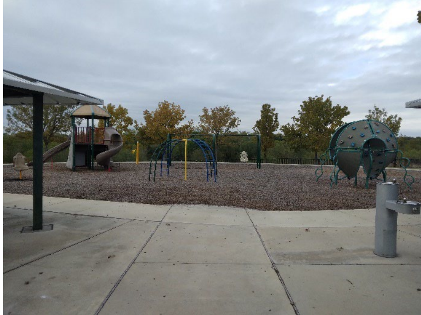
No Shade – Agave Neighborhood Park (D1)