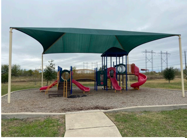
Full Structured Shade - Stoney Ridge Neighborhood Park (D2)