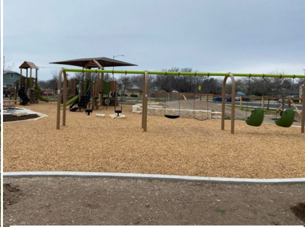
Partial Structured Shade – Alderbrook Pocket Park (D7)